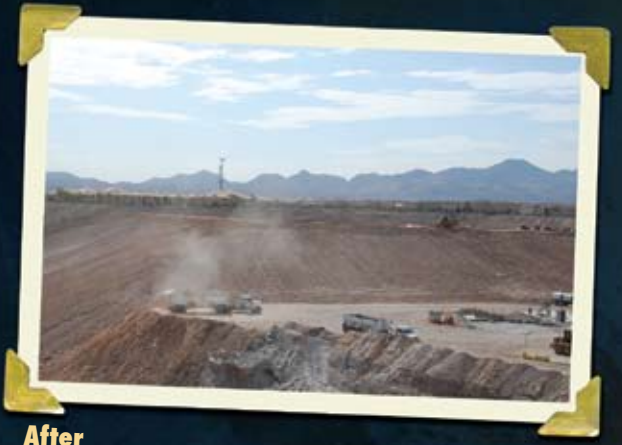
After ...to reality! The first 10 acres has been graded for phase one of building construction, and another forty acres to the rear of the property are ready to develop into sports fields.

Capstone Christian School admits students of any race, color, or national and ethnic origin to all the rights, privileges, programs, and activities generally accorded or made available to students at the school. It does not discriminate on the basis of race, color, or national and ethnic origin in administration of its educational policies, admissions policies, scholarship and loan programs, and athletic and other school-administered programs.