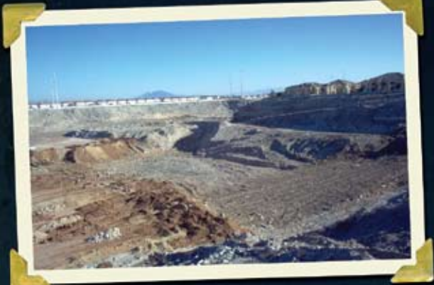
Before The 75 acre foundation of the school has literally risen from a rock quarry...