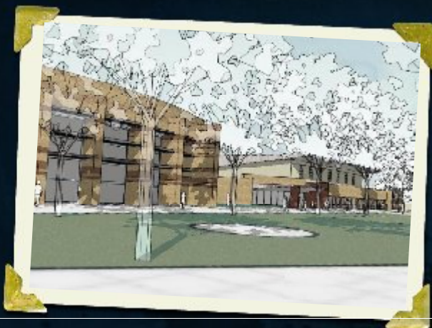
Capstone Christian School Phase One Work in Progress as of October 2008

Capstone Christian School admits students of any race, color, or national and ethnic origin to all the rights, privileges, programs and activities generally accorded or made available to students at the school. It does not discriminate on the basis of race, color, or national and ethnic origin in administration of its educational policies, admissions policies, scholarship and loan programs, and athletic and other school-administered programs.